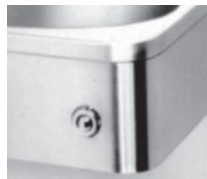
Handi-Tap Metering Valve

Valve is actuated by a push button located on front of bowl apron. Provides metered flow of water, adjustable for 5 to 60 seconds. Unit complies with water and energy conservation requirements. Units can be furnished with Vernatherm mixing valve if desired.