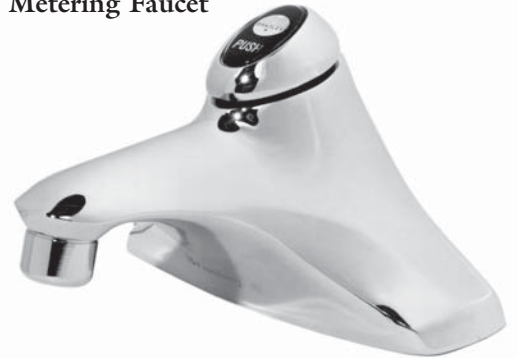
90-75 Metering Faucet

Heavy chrome-plated brass faucet is actuated by light push of button. Provides metering flow of water, for approximately 20 seconds. Unit complies with water and energy conservation requirements. Units can be furnished with Vernatherm mixing valve if desired.