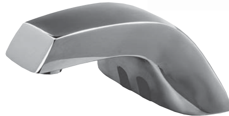
Futura Model 900

Chrome-plated, solid cast brass faucet is actuated when the user's hands enter a broad detection area within the lavatory bowl. Flow automatically stops when hands are removed. Flow rate is .5 GPM.