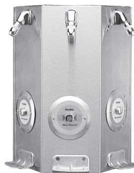
WS-3W Wall-Mounted Shower: 3-station shower with TouchTime® valve.