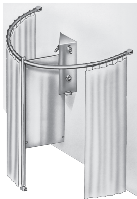
WS-2W-MS Privacy Shower: 2-station Econo-Wall multi-stall shower.