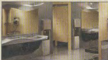
Multi-height solid surface lavatory systems, like those being installed at Blues Club, are attractive and extremely durable, making them a good fit for a variety of busy restrooms — from hotel lobbies to malls and more. Multi-height lavatory systems work well for users of all sizes and abilities and can be effective in family restrooms.

Jumbo-sized tissue dispensers and (Turn to Bradley, page 36.)